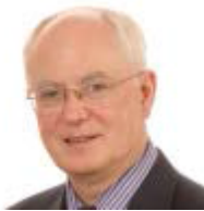
Dr Stewart Findlay

To meet these challenges, we will build on our strengths and maximise our opportunities to develop a modern, accessible, patient centred General Practice in DDES .